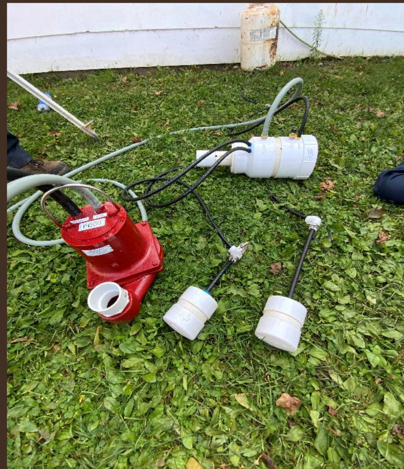
Air Compressor Pump